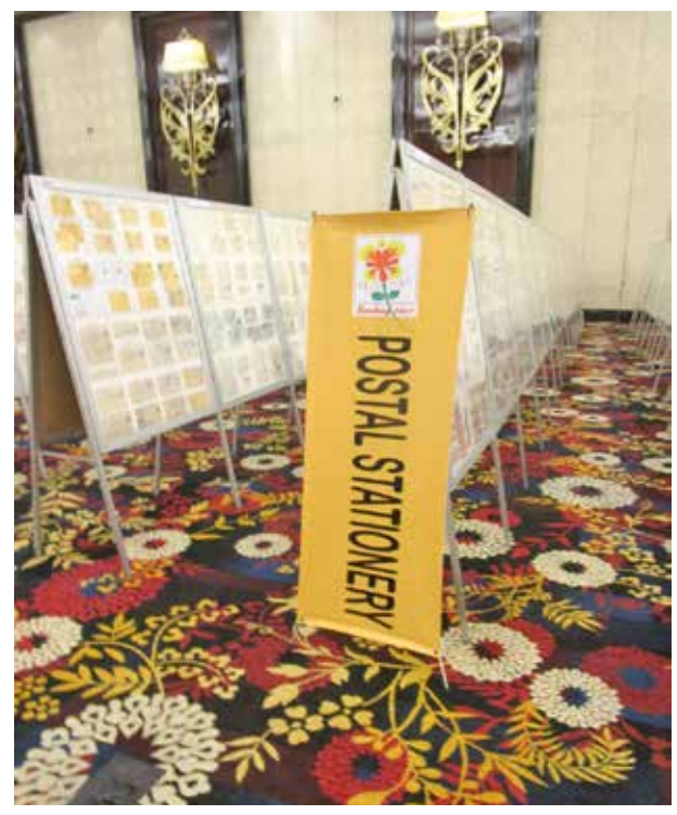
Postal Stationery Class at Bandung 2017