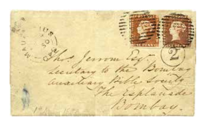
The Bombay Cover

But the venue is not the only one selected for PRAGA 2018: the Prague Postal Museum will be the location showing the Philatelic Literature Class. It will be joined by the Mucha Museum Prague introducing the works of the famous Czech painter Alfons Mucha, who is also the author of the very first Czechoslovak postage stamps and banknotes. Finally, PRAGA 2018 will be accompanied by the EXPO Stamp Fair situated at the Olympik Tristar Hotel near the main exhibition building. Please find here the summary of all the PRAGA 2018 locations.