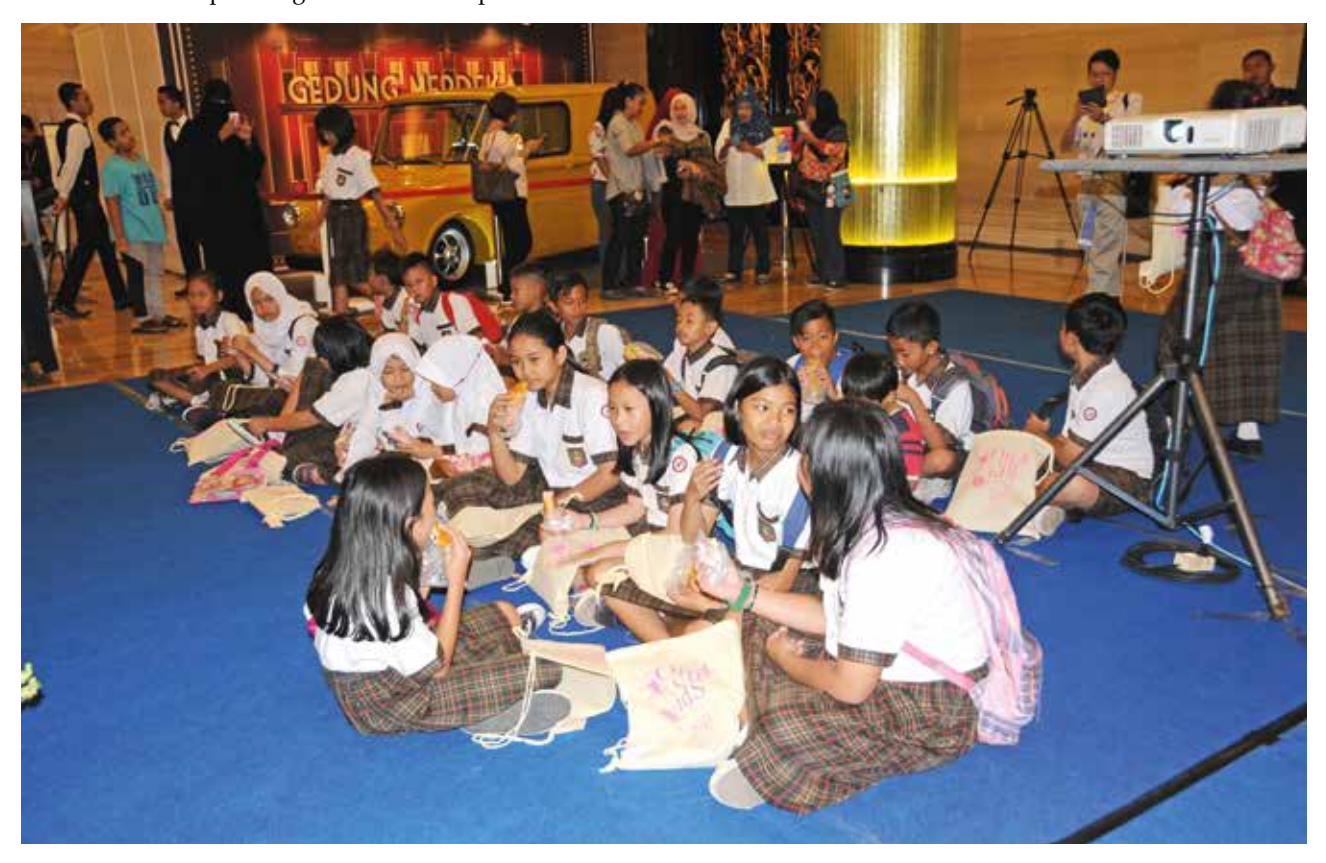
A total of 450 competitive exhibits were judged with 21 Large Gold medals and 65 Gold medals awarded.

BANDUNG 2017 Specialised World Stamp Exhibition was held from August 3 -7, 2018 at the Trans Studio Convention Centre under the patronage of FIP and auspices of FIAP.