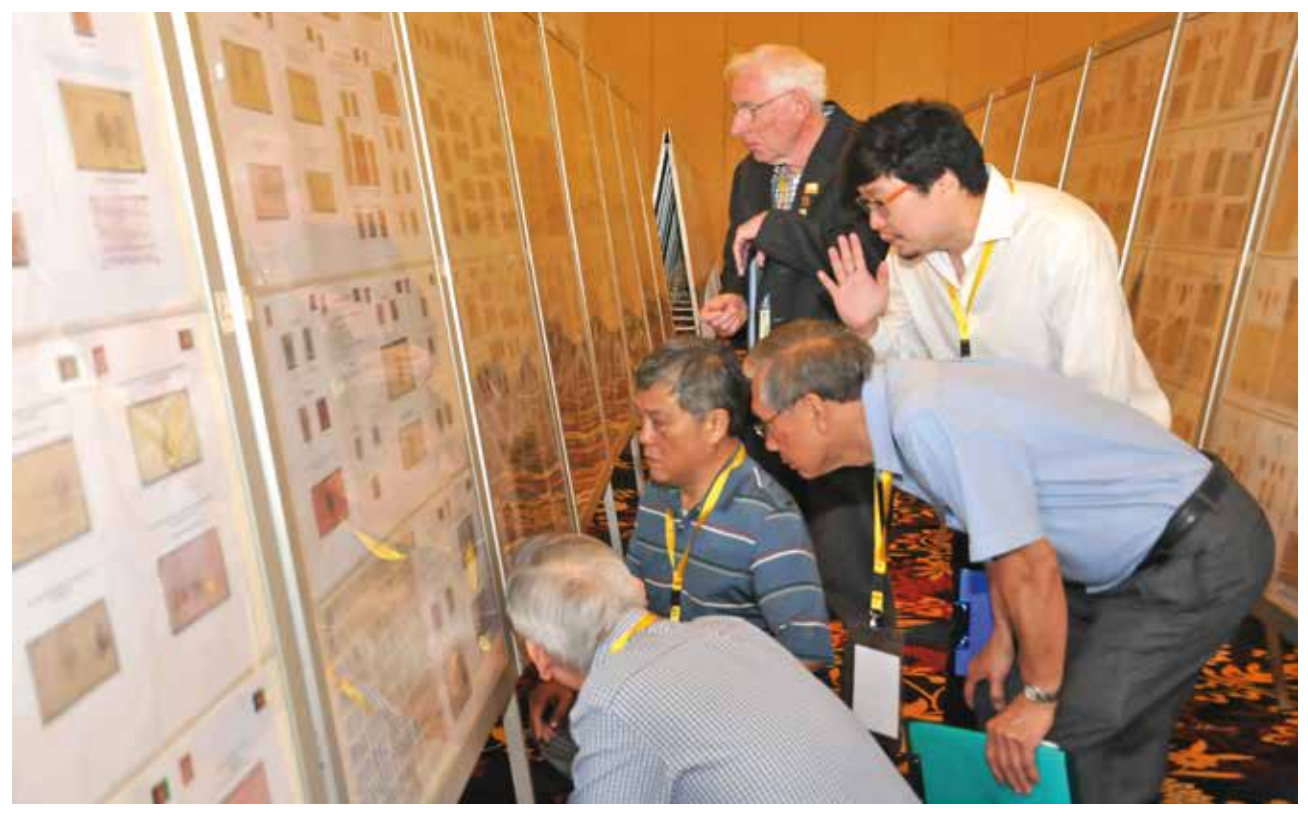
The jury at work