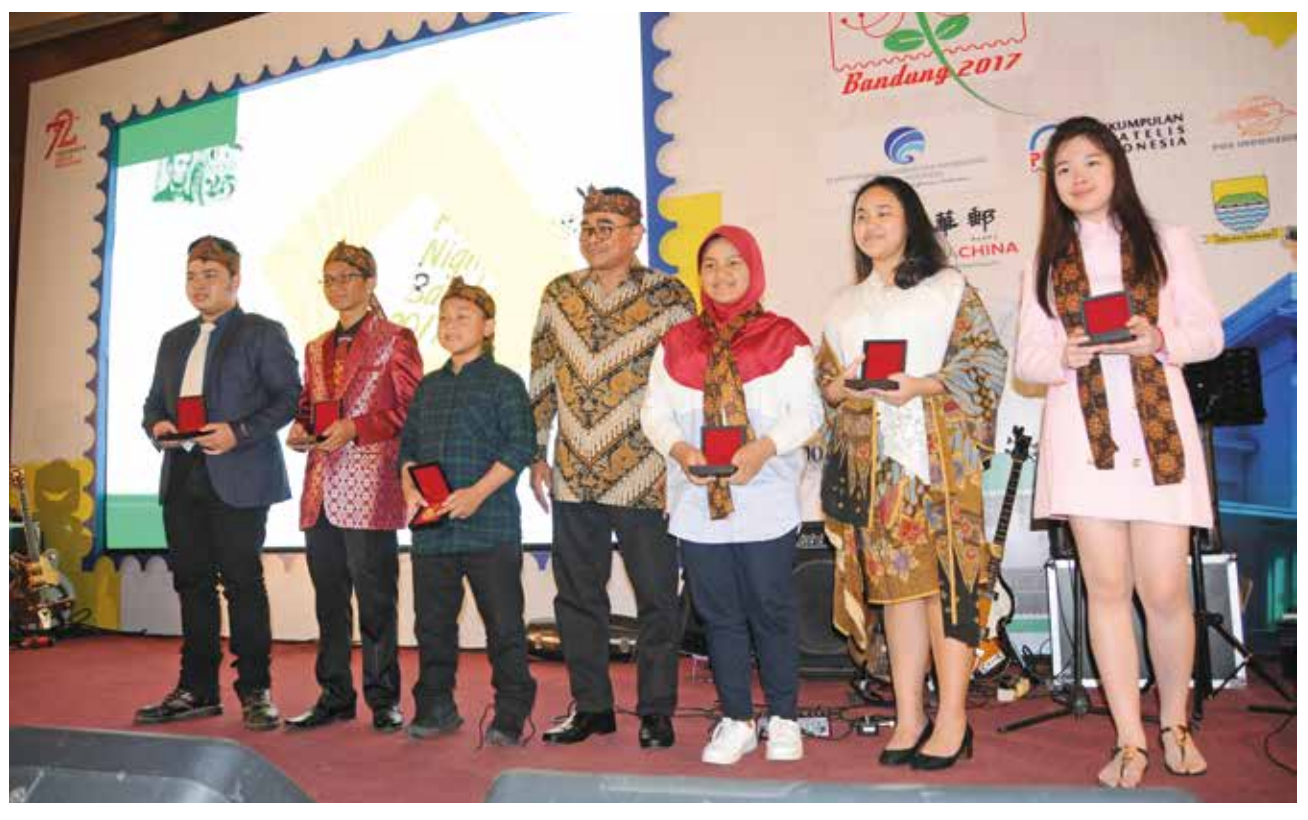
Youth exhibitors get their medals on the stage