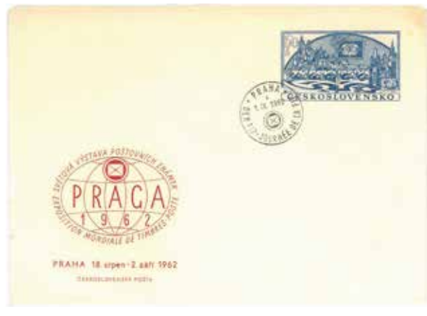
PRAGA 1962 postal stationary cancelled at the exhibition post office on Sept. 1, 1962, the F.I.P. Day

The next PRAGA exhibition organized in 1962 was a totally different event. The idea of bringing philately to the working class was over and the exhibition was open for the collectors around the world. Thanks to the FIP support, PRAGA 1962 was the very first World Stamp Exhibition in the philatelic history.