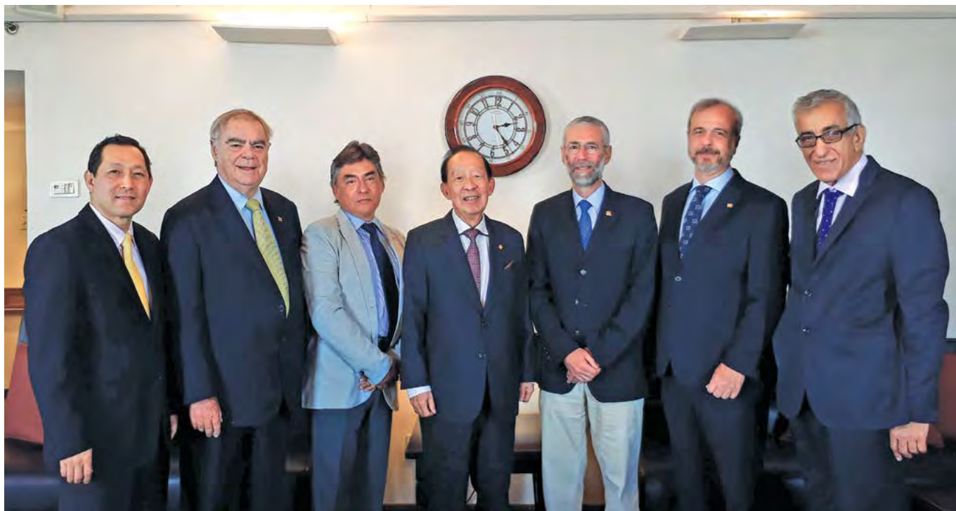
FIP Board of Directors at the 117th Board meeting in Jerusalem on June 1, 2018.