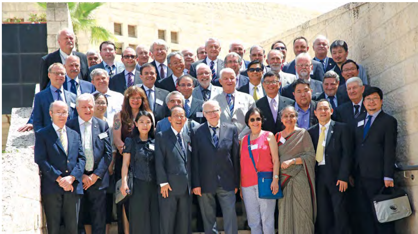
National Commissioners of ISRAEL 2018