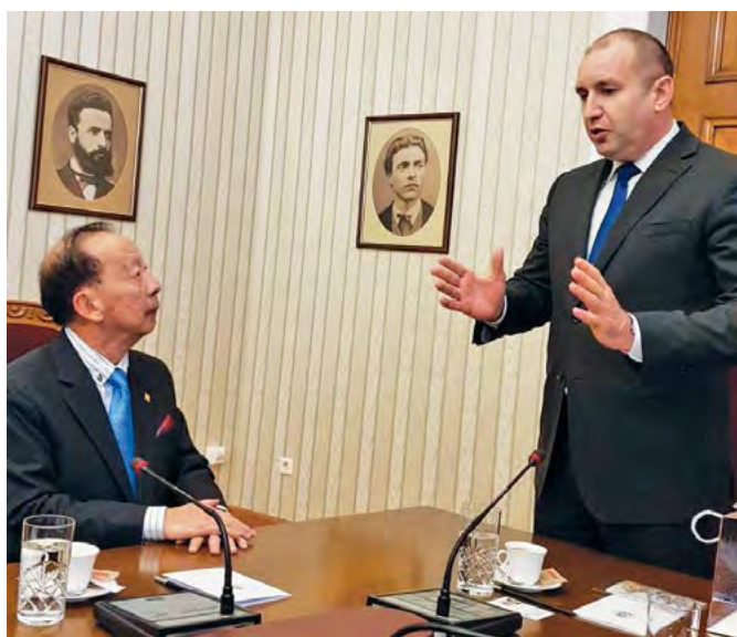
Mr Rumen Radev (right), President of Bulgaria, sharing passionately about his views on philately, at the President’s Office in Sofia on April 17, 2018.

vision of FIP. Both Ministries agreed that philately was an important aspect of culture and arts, to be further promoted to the young adults and school children in Bulgaria. Finally, the FIP Board members had the honour to meet Mr Rumen Radev, President of the Republic of Bulgaria at the President’s Office. It was very heartening to know that President Radev was very supportive of philatelic exhibitions in Bulgaria.