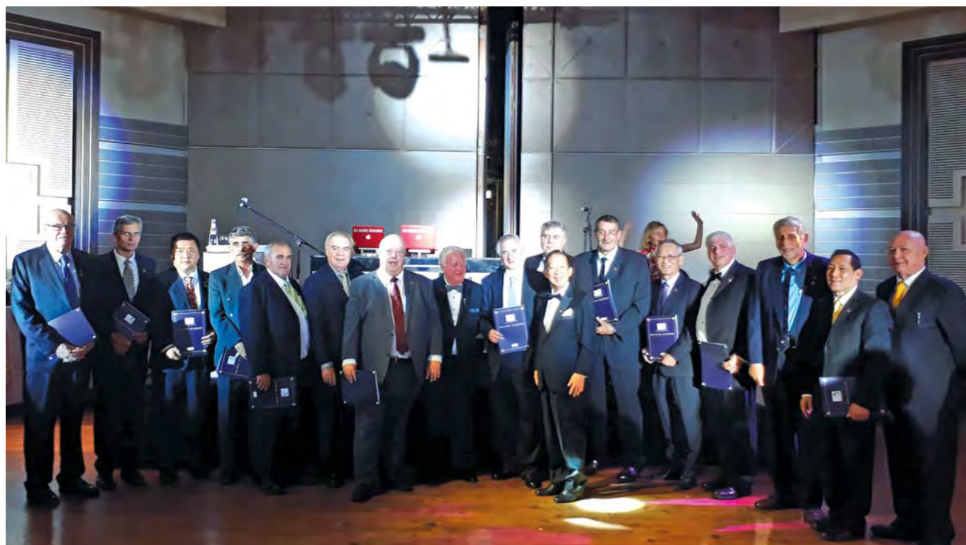
Presentation of certificates and FIP Jury Fellow pins to FIP Jury Academy participants during Palmares night.