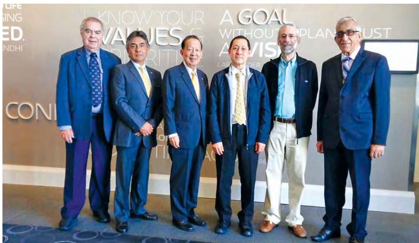
The FIP Board of Directors at the meeting room of hotel Novotel, Brisbane on February 10, 2018.