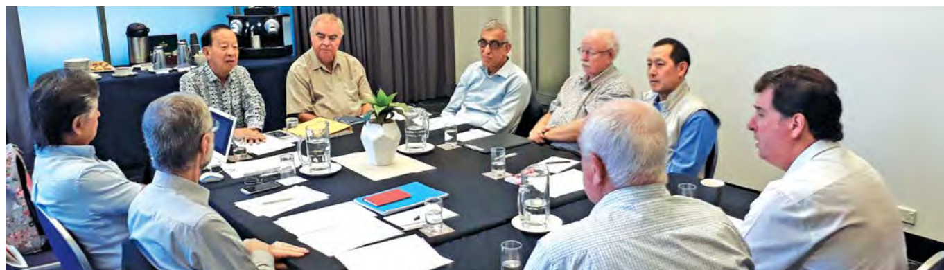
FIP Board meeting with the APF Executives in Brisbane, February 11, 2018.