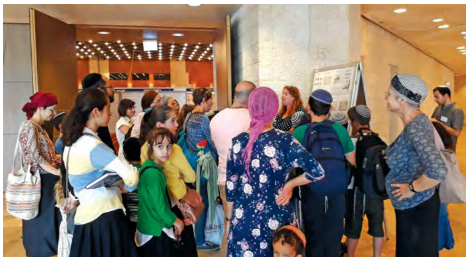
An educational volunteer sharing passionately with visitors on how to start an exhibit.