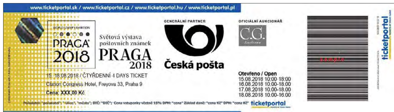
Sample image of PRAGA 2018 ticket

The PRAGA 2018 tickets are valid during the exhibition days also for a free entrance to Prague Postal Museum (Nové Mlýny 2, Praha 1) and to the EXPO Fair (U Sluncové 14, Praha 8). The Mucha Museum Prague (Panská 7, Praha 1) will give a 50% discount to the PRAGA ticket holder.