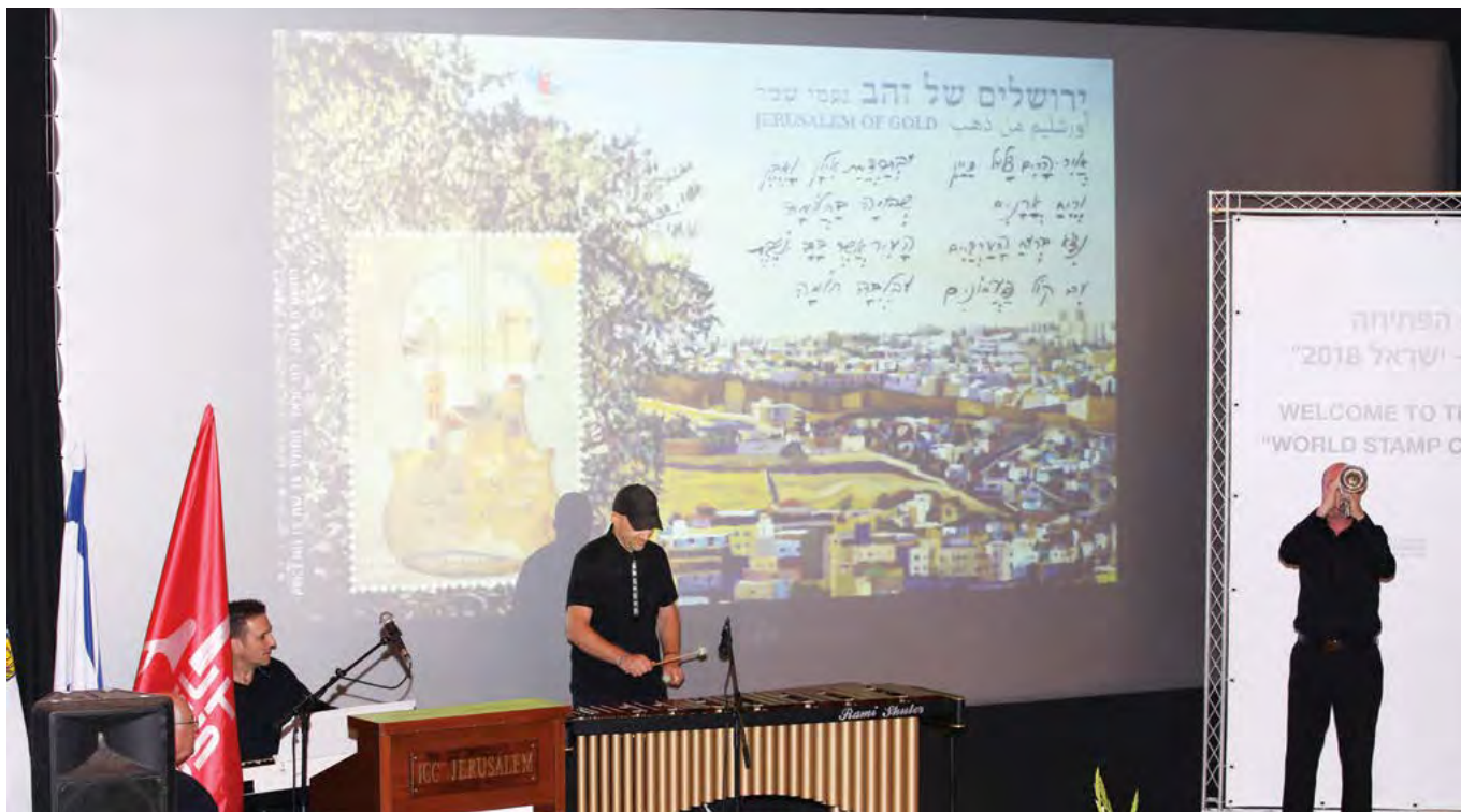
Opening Ceremony cultural performance