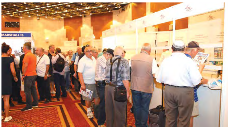
Crowd at the trade booths area (Photo Courtesy of Israel Philatelic Federation).