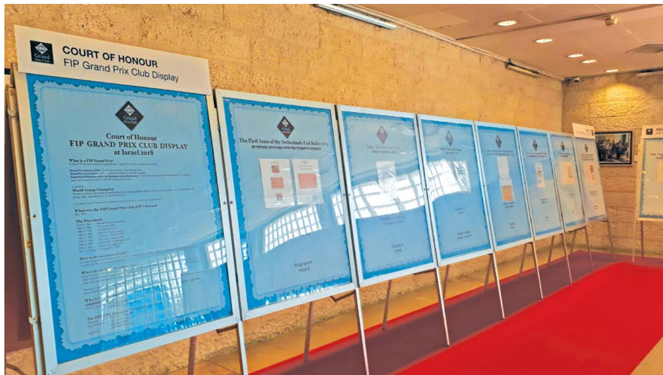
FIP Grand Prix Club displays at Court of Honour.

The invited FIP Grand Prix Club exhibits for the ISRAEL 2018 World Stamp Championship exhibition were displayed at the Court of Honour, situated prominently beside the main entrance of the International Convention Center, the exhibition venue.