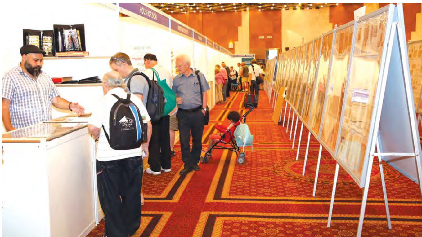
Trade booths and displays of exhibits in the main hall

The Competitive Classes were World Stamp Championship Class, Traditional Class, Postal History, Modern Philately, Literature, totalling more than 1,000 frames. The National Commissioners were personally involved in the mounting and dismounting of the exhibits and they also checked that all philatelic items were in order, before signing on a confirmation form. This measure increased the efficiency of the set up and tear down of frames greatly. The exhibit titles of exhibitors who were present at the exhibition were also highlighted on the form, for a smoother preparation of the presentation of awards for the Palmares night.