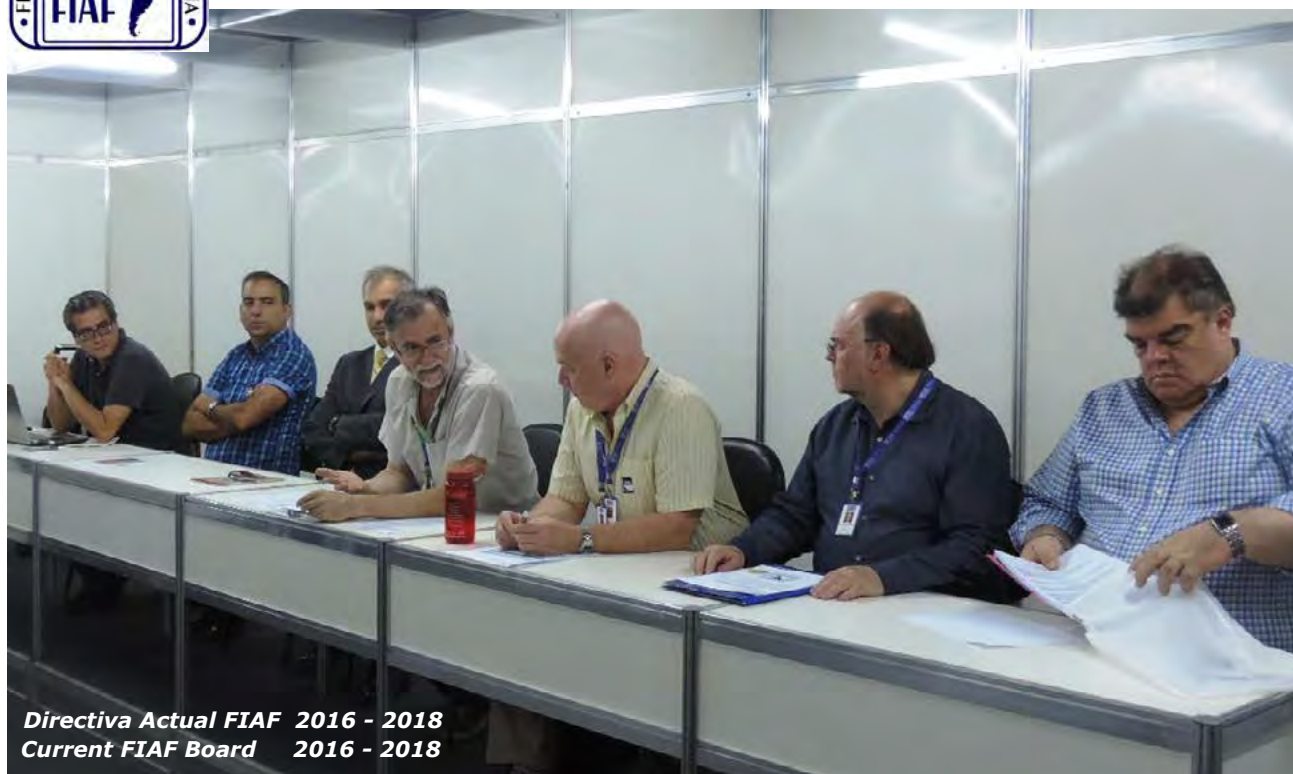
Directiva Actual FIAF 2016 - 2018 Current FIAF Board 2016 - 2018

El 13 de octubre se realizará el Congreso de la Federación Interamericana de Filatelia. Será uno de los eventos programados de la Exposición Filatélica Continental EXFIL2018, y la V Exposición del Pacífico Sur, que se realizará en Santiago de Chile, del 9 al 13 de octubre de 2018, en el Hotel Presidente Suites, Luis Thayer Ojeda 383 St., Providencia, Santiago de Chile.