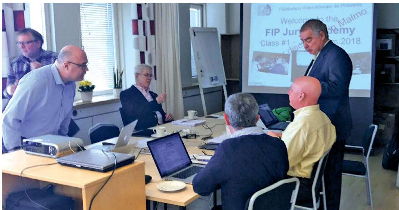
The trainers hard at work.

Training is not an inexpensive exercise. FIP has subsidised both the trainers' expenses in Malmo and the trainees' expenses in Jerusalem. Two additional FIP Jury Academy courses (for 30 jurors in total) will follow in Bangkok in conjunction with