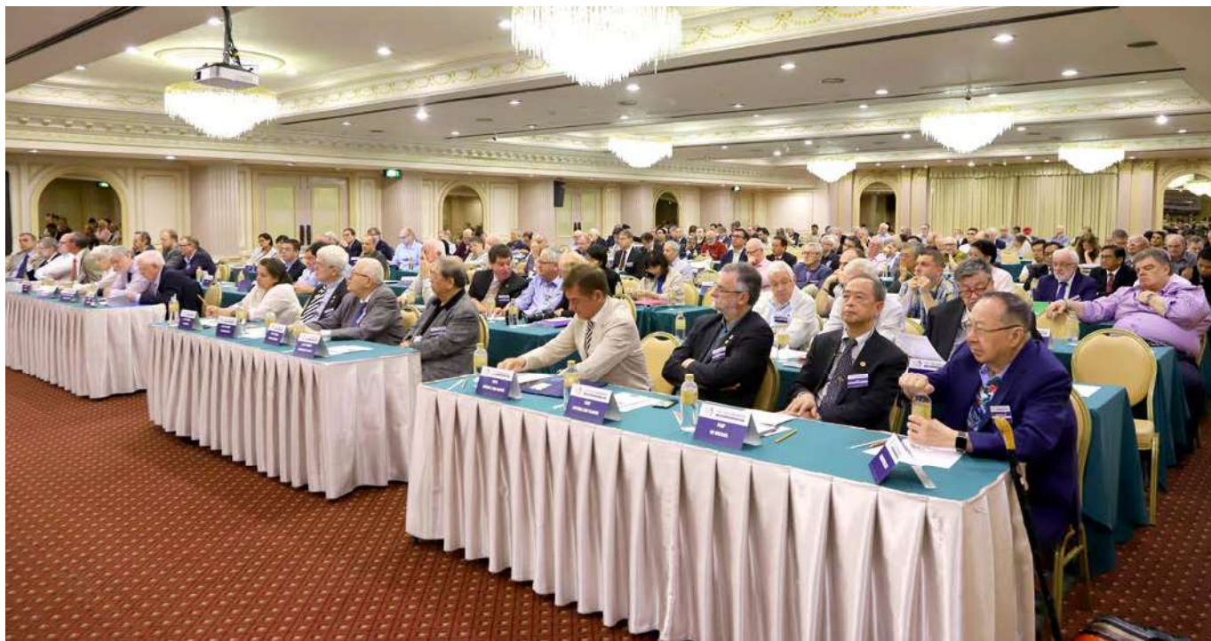
Delegates of Member Federations attending the 75th FIP Congress.