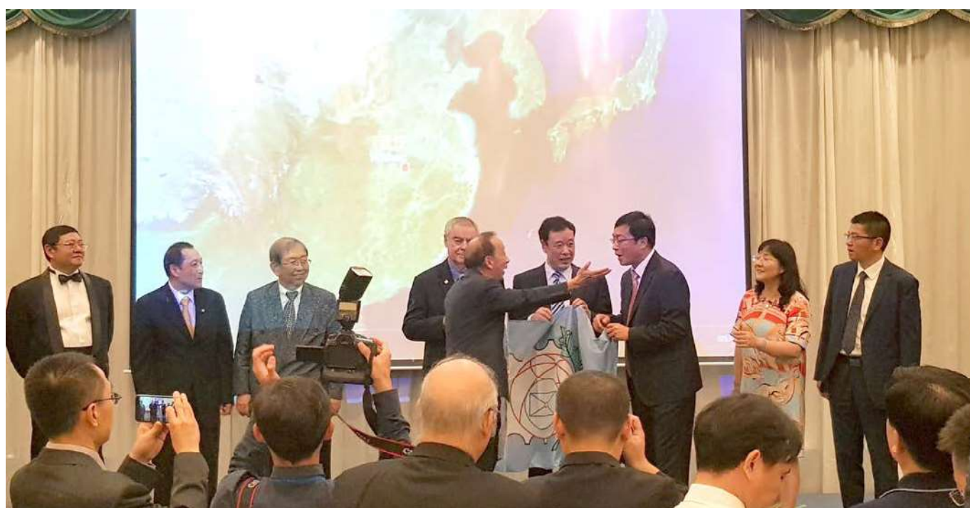
Transfer of the FIP flag from THAILAND 2018 to CHINA 2019