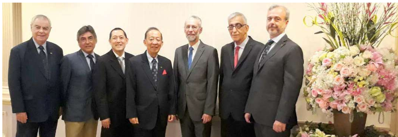
The FIP Board of Directors before the start of the Board meeting.