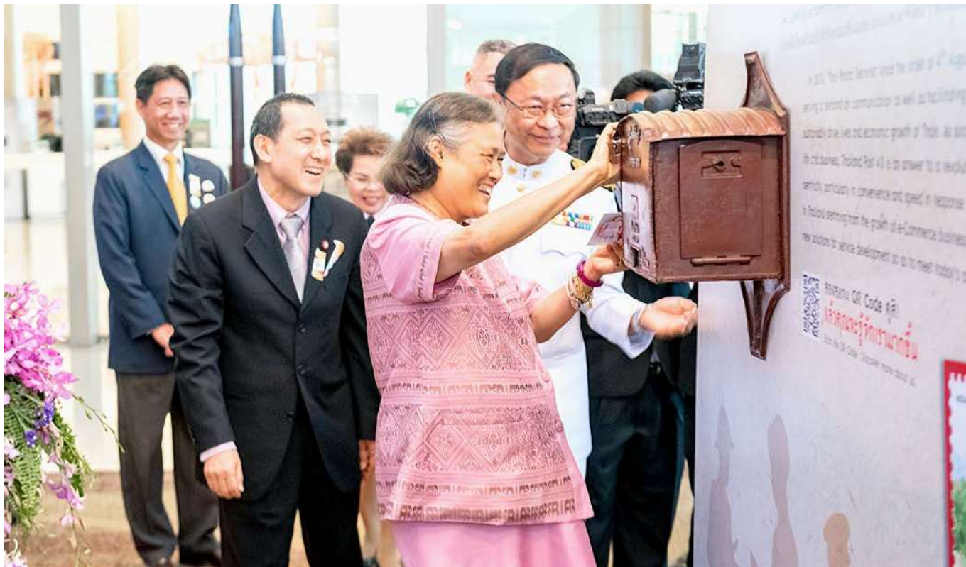
H.R.H. Princess Maha Chakri Sirindhorn (foreground) posting the THAILAND 2018 postcard with Her Royal Message and touring the exhibition hall.

of the congratulatory envelop for each Grand Prix award winner on 3 December, 2018 at 3pm.