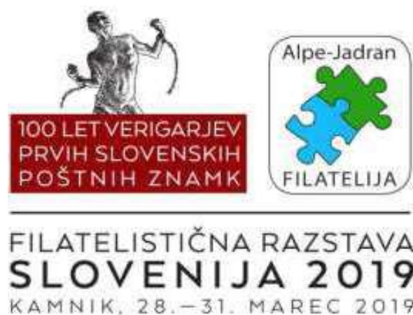
Logo of the philatelic exhibition SLOVENIJA 2019