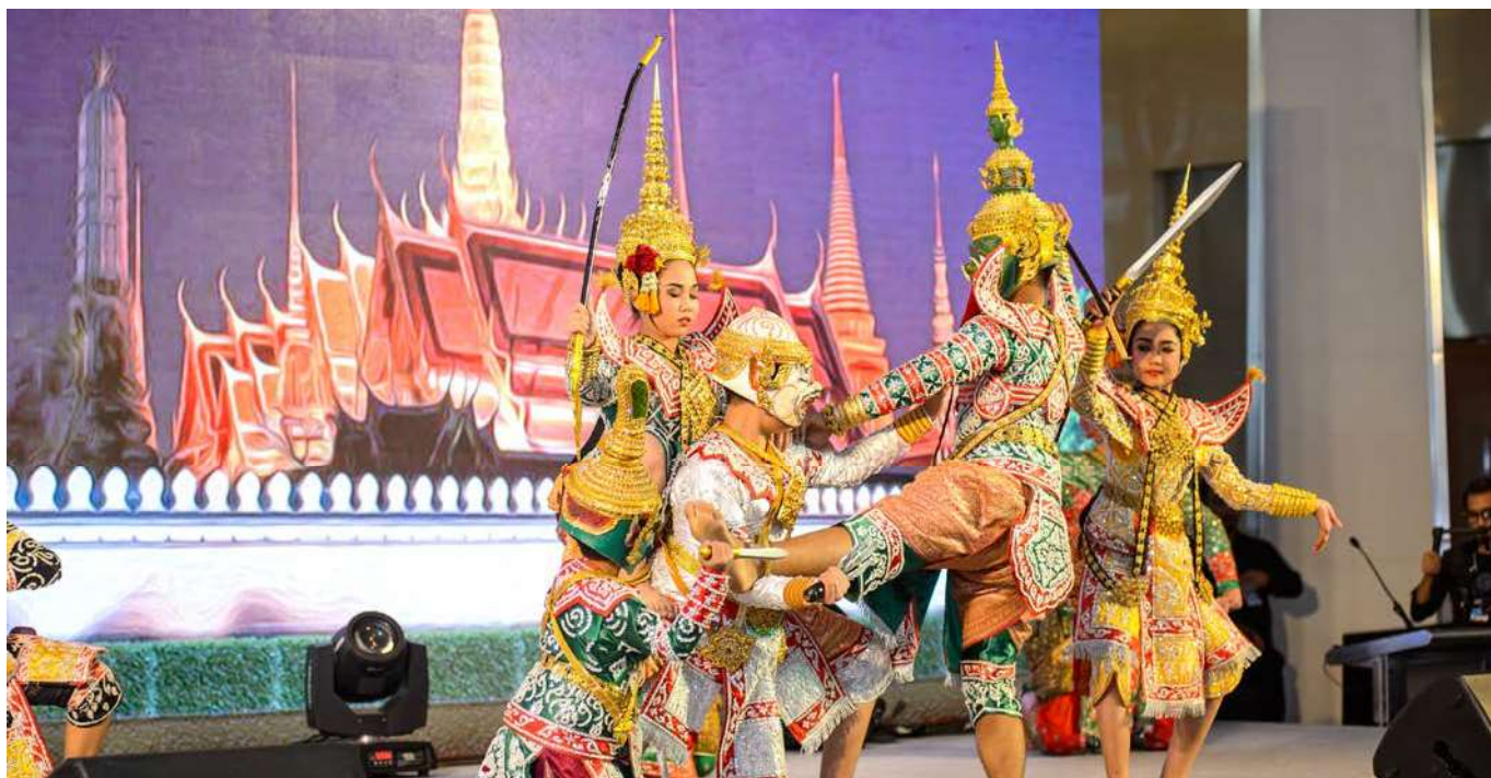
Traditional Thai cultural performance at the Opening Ceremony.

2018. The exhibition was held under the Auspices of the Federation of Inter-Asian Philately (FIAP), Patronage of FIP and supported by Thailand Post Co., Ltd under the supervision of the Ministry of Digital Economy and Society. The Opening Ceremony was held at the Royal Paragon Hall on 28 November, 2018.