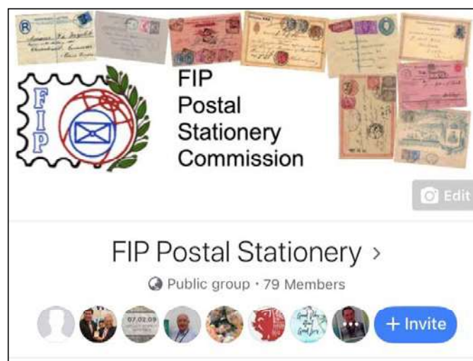
Postal Stationery Commission Facebook Page

all invited to join the page. To do so search on Facebook for: "FIP Postal Stationery". Everyone interested in Postal Stationery is welcome to join the page and use it to share photos, comments and ask questions.