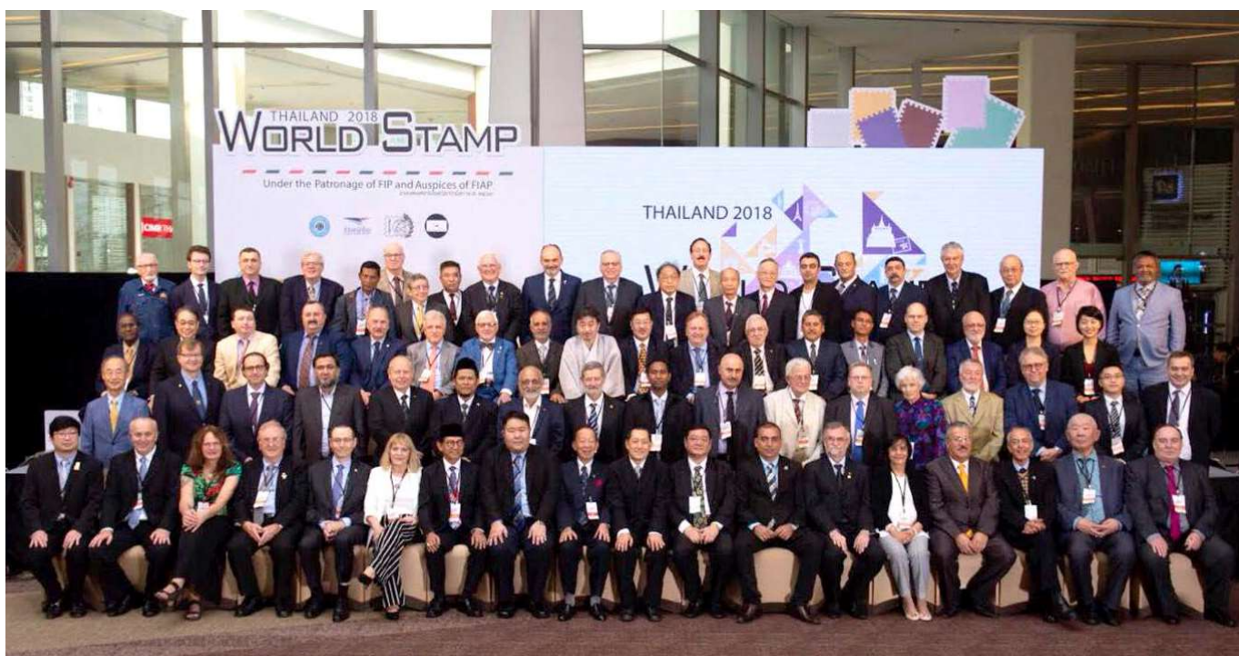
Commissioners for THAILAND 2018