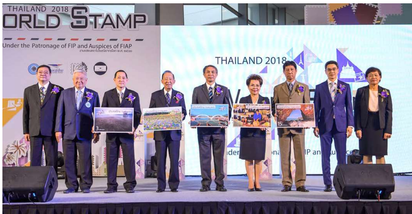
Official launch of THAILAND 2018.