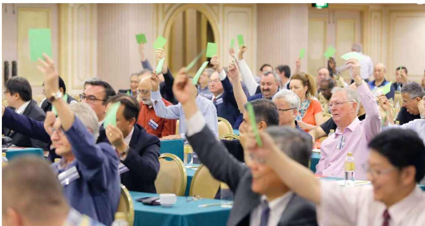
Voting by Congress delegates.