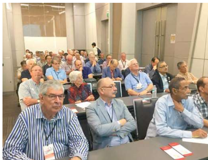
Attendees at the Postal Stationery Seminar

The Postal Stationery Commission's Facebook page was launched at the Seminar. The page now has about 80 members. The Commission will update the Page with news on exhibiting and judging postal stationery and you are