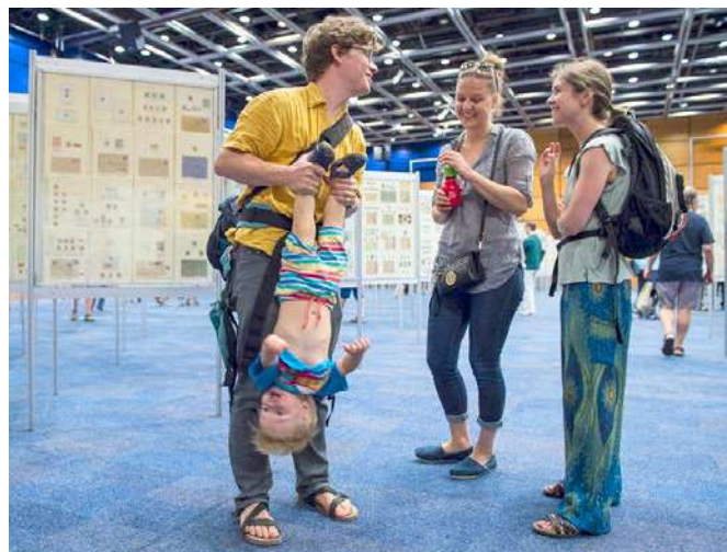
Youth collector enjoying the PRAGA visit!

Because we live in the Internet world, a part of the activities was aimed at the e-environment. The Postal Museum was used for a meeting of the Zvědátoři YouTubers with their fans. The You Tubers promoted the PRAGA exhibition and the session in advance, the fans had therefore a good chance to come to Prague to see their “heroes” face to face. The Zvědátoři also promoted the exhibition by a special video published on the opening day introducing the most expensive postage stamps to the YouTube audience. The video in the Czech language can be seen at https://www.youtube.com/watch?v=Q_gtovl2vec achieving more than 7.000 individual visits!