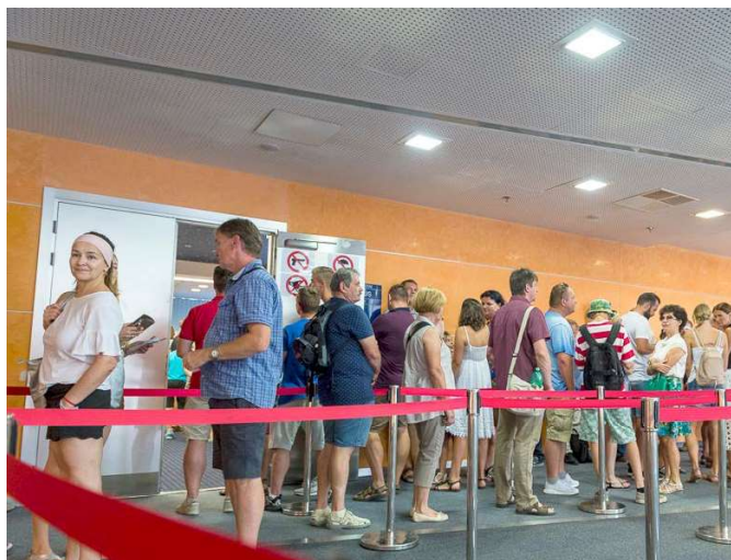
Queues in front of the Court of Honour at PRAGA 2018