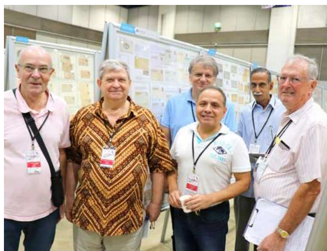
The Thailand 2018 Postal Stationery Jury.