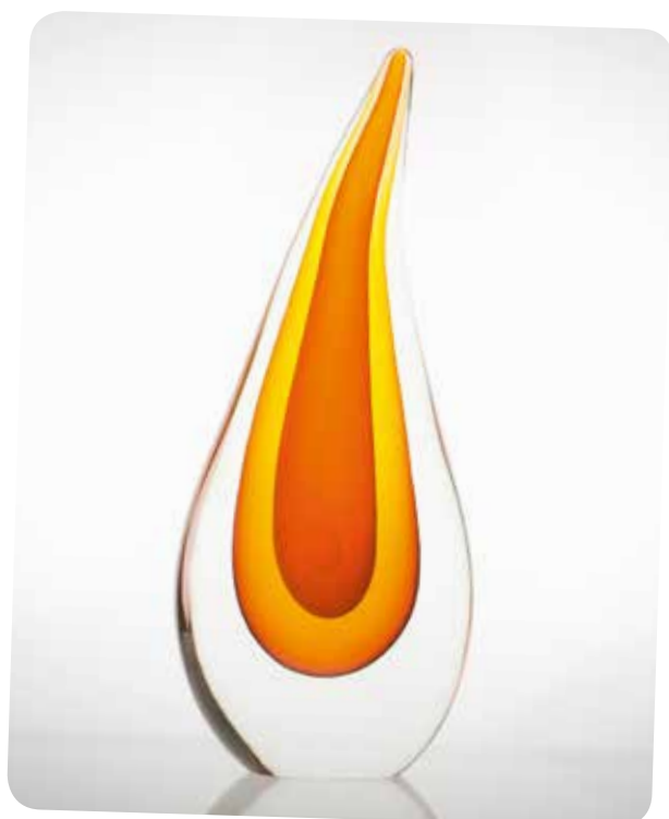
Grand Prix International donated by FIP